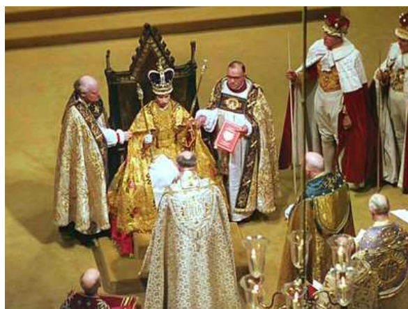
The Queen Enthroned with “The Royal Law”